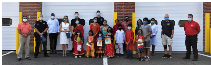
Rakshabandhan Celebrations with first responders in Connecticut

Since the middle of March, the entire world including the United States faced an unprecedented challenge of COVID-19. When the surrounding community was facing a dire challenge, our members used their organizational skills and discipline and offered services to the needy, to the first responders, and to the healthcare professionals. Our volunteers in various communities worked in groups to feed needy and homeless people, support senior citizens, supply groceries to the needy, make PPEs, provide meals and PPE to first responders, and did fundraising for food pantries and local relief organizations, etc. They also collaborated with and brought together various other organizations to multiply the efforts and help. Various authorities appreciated HSS volunteers for their selfless service. New Jersey General Assembly proclaimed and praised HSS work at the time of need.