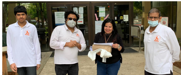
Swayamsevaks providing masks to a hospital in Seattle

HSS celebrates Raksha Bandhan as a Universal Oneness Day when volunteers tie a thread (Rakhee/Raksha) to each other and to the community leaders, to the first responders, etc. and express their commitment to protecting the society. At the time of printing of this report, Raksha Bandhan events were being conducted at several places. In some places our volunteers met Police, and the elected officials in person while maintaining social distance. However, many places HSS volunteers organized an online meeting with the elected officials from the local to the federal levels.