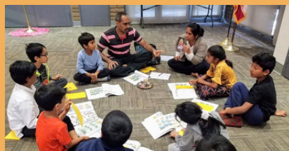
Dharma bee lessons being conducted in Irvine, California

Dharma Bee, a unique nation-wide quiz contest, was conducted throughout the US this year with a participation of 4,654 children.