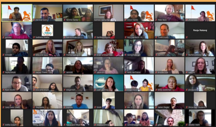
Guru Vandana celebrated by Sadhana Shakha in Indiana

Guru Vandana or teachers' appreciation day is a flagship program that gives our youngsters an opportunity to invite their teachers and appreciate them according to Hindu culture. It takes place during the month of May, coinciding with National Teachers Week. This year it was a challenging year because of the stay-home advisory. However, it did not stop our members and children from organizing events innovatively. Many HSS branches developed video greetings by children and sent them collectively to schools for their teachers. Some places also made handmade greeting cards and email messages to send to their children. Some branches developed an e-Guru Vandana event on YouTube or Zoom and engaged teachers and educators with a unique live event. A total of 42 Guru Vandana programs were conducted covering 79 shakhas. 23 Shakhas held 12 e-Guru Vandana events. Children appreciated 1639 educators from various schools and school districts across the country.