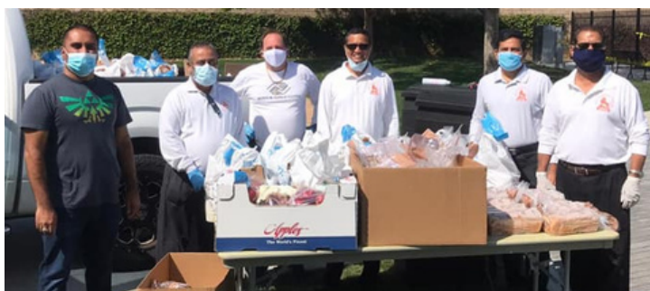
Food drive in California