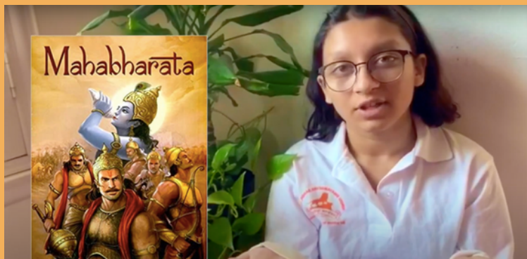
A kishore from Dharma Internship Program presenting story of Mahabharat

Over 120 adult mentors including many University students joined in and volunteered to help the interns in the projects and in the learning modules.