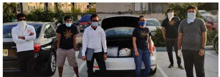
Grocery kits provided to students by Hindu YUVA at SDSU