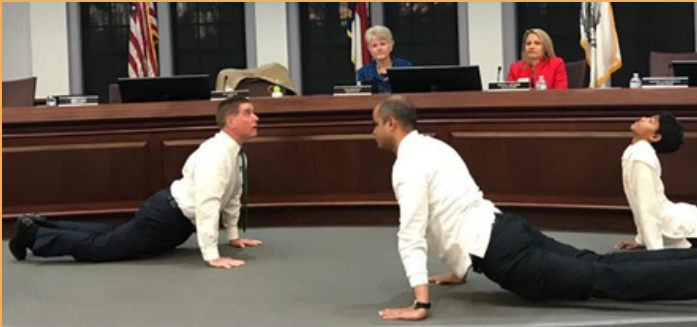
Mayor of Morrisville, NC performing Surya Namaskar

The thirteenth year of Surya Namaskar Yajna (SNY) was concluded on February 2, 2020. 82 public elected officials including mayors, governors, congressmen, and senators offered proclamations in their respective constituencies to promote this healthy activity among their constituents. This year, over 8,500 Yogathon enthusiasts from 36 states took part in this annual activity. HSS volunteers also engaged with the local schools and offered Surya Namaskar training to students, teachers, and administrative staff. This year 107 schools and 19,232 students took part in this activity and performed 115,032 Surya Namaskar. At many places, volunteers' enthusiasms led to 24 SNY Marathon where a group of participants performed sets of Surya Namaskar in a relay manner for 24 hours.