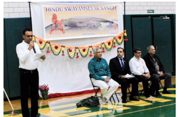
Congressman Raja Krishnamoorthi at Chicago Vijayadashami Utsav

Vijaya Dashami is the foundation day of HSS USA. It is one of the six Utsavs (festivals) that HSS celebrates every year. In October 2019, HSS celebrated Vijaya Dashami Utsav at 43 locations nationwide. "Sharirika Pratyakshik," or a physical activities demonstration, yogasana, games traditional to India such as kho-kho and kabaddi, or synchronized calisthenics followed by Ghosh sanchalan, or marching band, were part of their celebration. 9,368 youths, adults, and children from 207 branches and several distinguished guests took part in these celebrations, including Congressman Raja Krishnamoorthi at Chicago Chapter celebration.