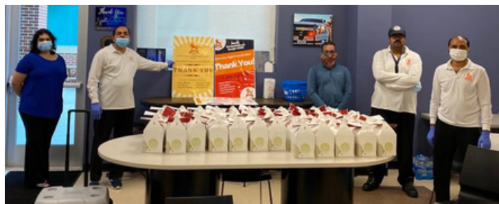
Swayamsevaks in Dallas, Texas thanking essential workers