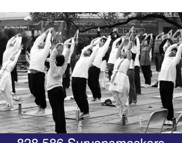
828,586 Suryanamaskars During Suryanamaskar Yajna