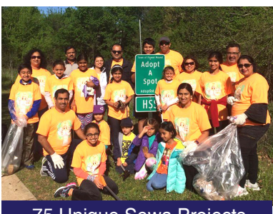
75 Unique Sewa Projects